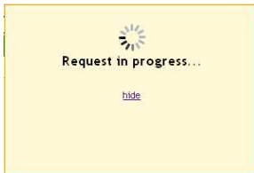
Figure 1: SmartWeb Progress Panel

The SmartWeb user interface presents information in web pages and collects user inputs via a series of web page forms. Navigation is done through hyperlinks or image buttons. The interface has been designed to minimize page refreshes with most requests occurring asynchronously using a technology called AJAX. This will result in parts of the web page being updated instead of the whole page reloading and blinking, or flashing. Normally when the page is working in the background an animated progress icon will appear.