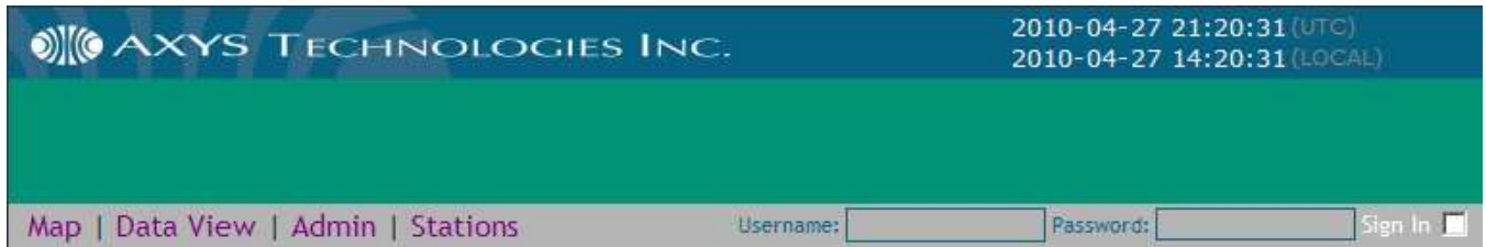
Figure 2: SmartWeb Common Page Header

At the top of each page is the common header. Each page has a descriptive title under the common header and may contain common image buttons and links on the page.